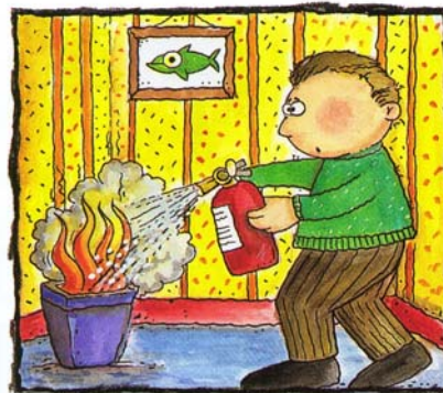
For use on small contained fires