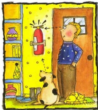
Install extinguishers in plain view