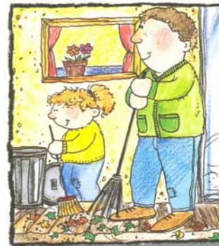
Clean up debris