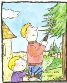
Prune trees regularly